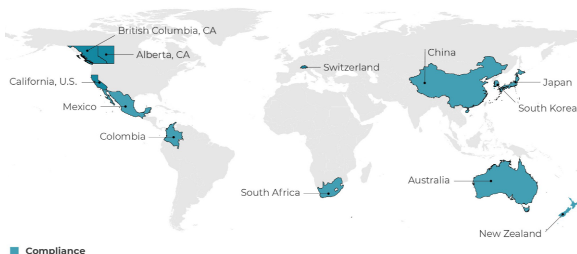
Figure 3. Map of compliance policy programs that allow the use of forestry and/or land use offsets

Note: Not included is Taiwan's Cap-and-Trade scheme which is currently under development. Early action under the scheme permits credits from domestic forestry-related activities.