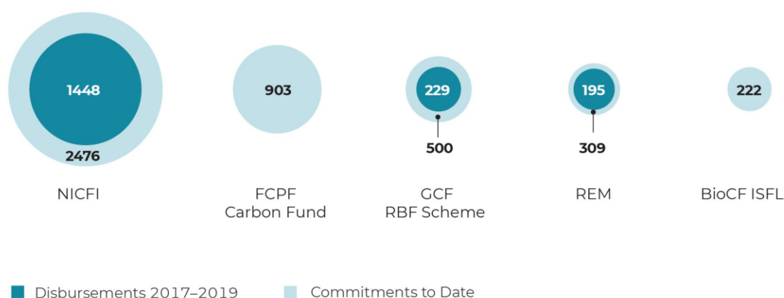
Figure 1. Progress in results-based REDD+ finance (2010–2019), in million USD

Sources: Based on data obtained from personal communications with NICFI and REM; and GCF's REDD+ Results-Based Payment Pilot, BioCarbon Fund ISFL and FCPF Carbon Fund commitments retrieved from funds' official websites. FCPF Carbon Fund disbursements retrieved from their 2019 Annual Report, page 73.