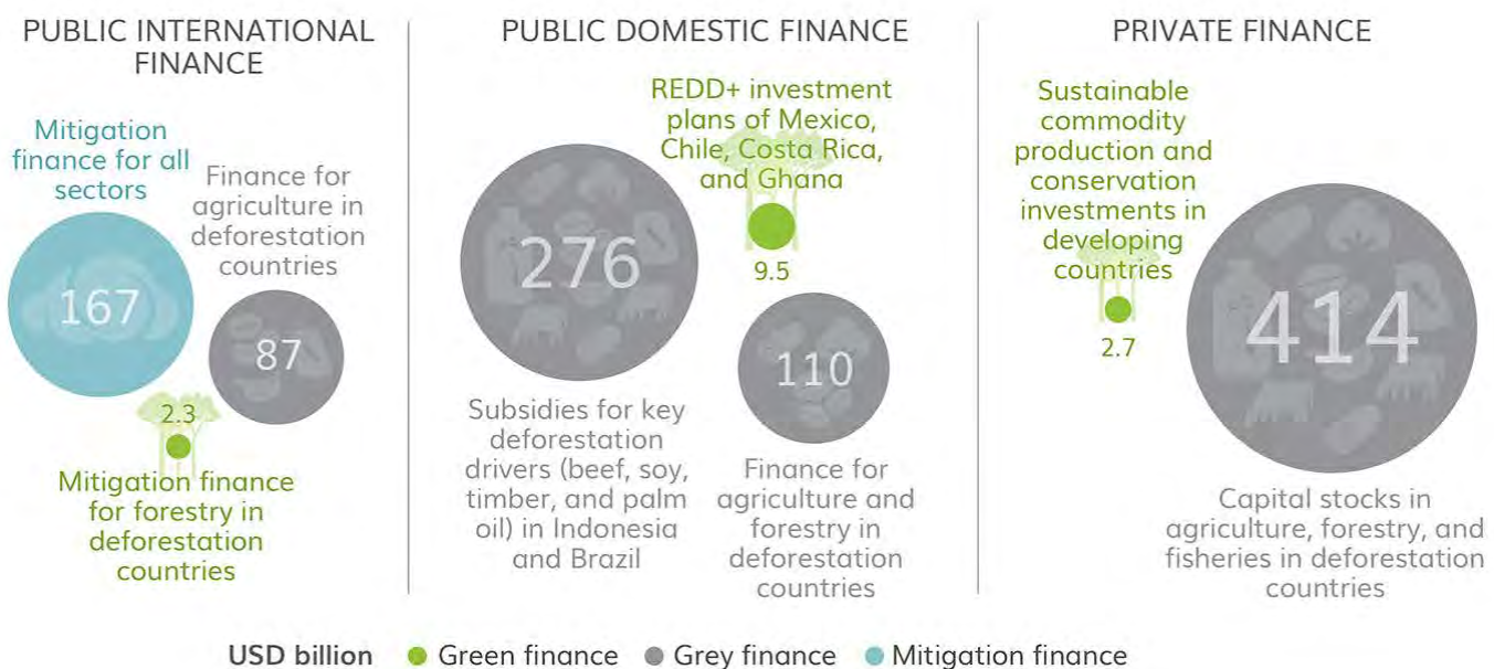
Figure 1: Green and grey finance flows captured by the Goal 8 Progress Assessment (excluding REDD+ finance, since 2010)